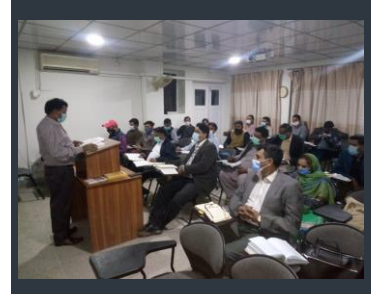
Evening Students are in the New Testament Class